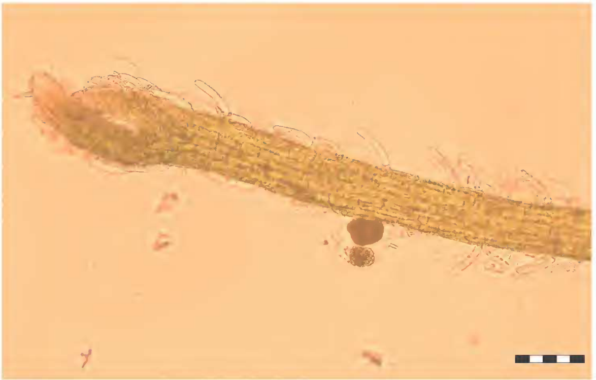
Figure 7: Microscopic photo of an U. neottiioides leaf from in-vitro culture. Scale = 100 \mu\text{m} .